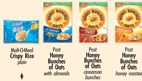
Malt-O-Meal Crispy Rice plain Post Honey Bunches of Oats with almonds Post Honey Bunches of Oats cinnamon bunches Post Honey Bunches of Oats honey roasted