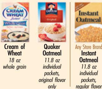
Cream of Wheat 18 oz whole grain Quaker Oatmeal 11.8 oz individual packets, original flavor only Any Store Brand Instant Oatmeal 11.8 oz individual packets, regular flavor