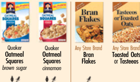
Quaker Oatmeal Squares brown sugar Quaker Oatmeal Squares cinnamon Any Store Brand Bran Flakes Any Store Brand Toasted Oats or Tosteos