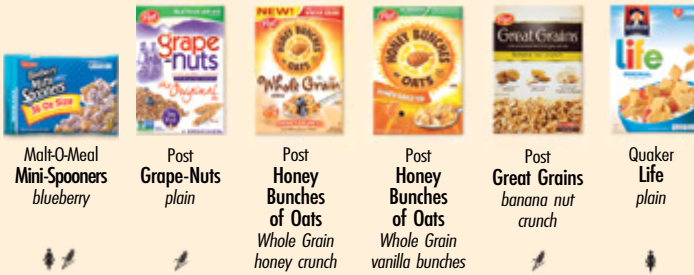
Malt-O-Meal Mini-Spooners blueberry Post Grape-Nuts plain Post Honey Bunches of Oats Whole Grain honey crunch Post Honey Bunches of Oats Whole Grain vanilla bunches Post Great Grains banana nut crunch Quaker Life plain