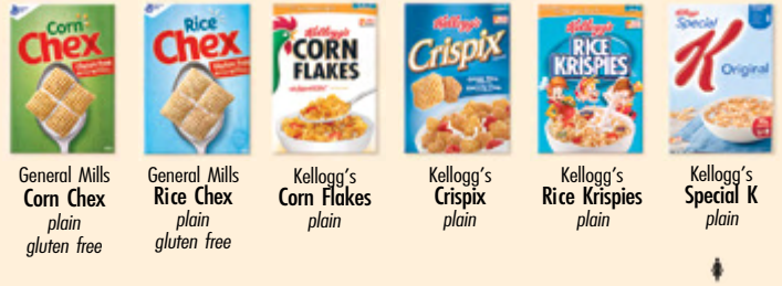
General Mills Corn Chex plain gluten free General Mills Rice Chex plain gluten free Kellogg's Corn Flakes plain Kellogg's Crispix plain Kellogg's Rice Krispies plain Kellogg's Special K plain