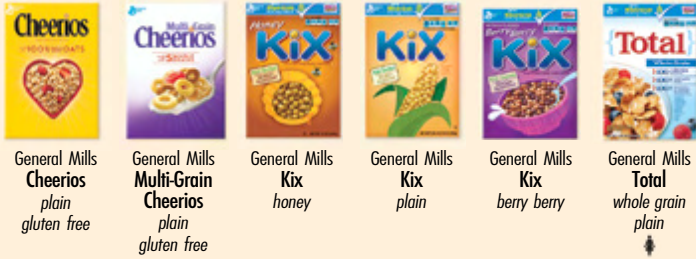
General Mills Cheerios plain gluten free General Mills Multi-Grain Cheerios plain gluten free General Mills Kix honey General Mills Kix plain General Mills Kix berry berry General Mills Total whole grain plain