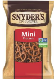
Snyder's Mini Pretzels