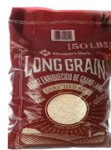
Member's Mark White Rice