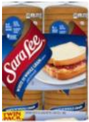
Sara Lee Whole Grain White