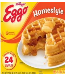
Eggo Homestyle Waffles