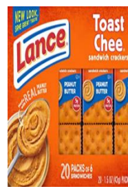
Lance Sandwich Crackers PB or Cheese