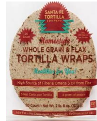
Santa Fe Tortilla Whole Grain & Flax