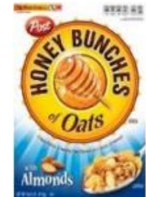
Honey Bunches of Oats With Almonds