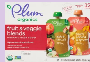
Plum Fruit & Veggie Blends

Note: Products change frequently. Check labels to confirm that a product is credible.