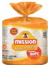
Mission Corn Tortillas