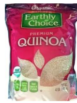
Earthly Choice Quinoa