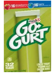
GoGURT All Flavors