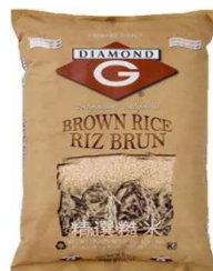
Diamond Brown Rice