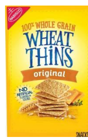
Wheat Thins Original