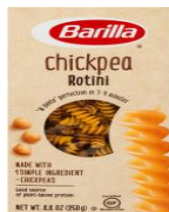
Barilla Chickpea Pasta