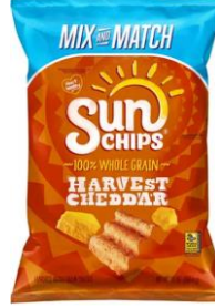
Sun Chips Harvest Cheddar