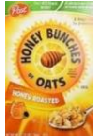
Honey Bunches of Oats Honey Roasted