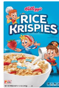
Rice Krispies Original