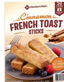
Member's Mark French Toast Sticks