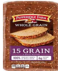
Pepperidge Farm 15 Grain