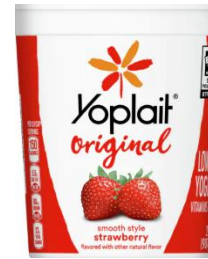
Yoplait Original - All Flavors Except Sea Salt Caramel