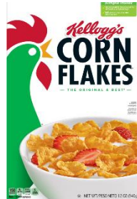
Corn Flakes Original