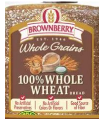
Brownberry Whole Wheat