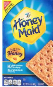
Honey Maid Graham Crackers