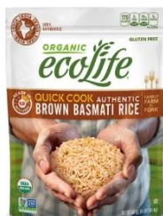
ecoLife Brown Basmati Rice