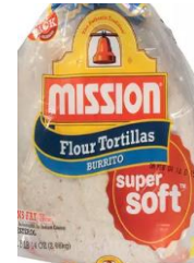
Mission Flour Tortillas