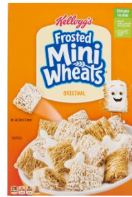
Mini Wheats Original