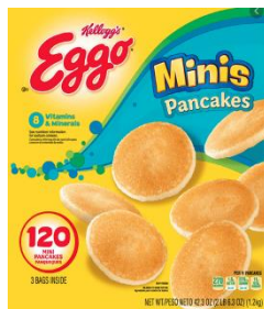
Eggo Mini Pancakes