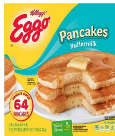
Eggo Buttermilk Pancakes