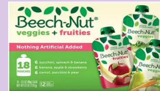
Beech-Nut Veggies & Fruits