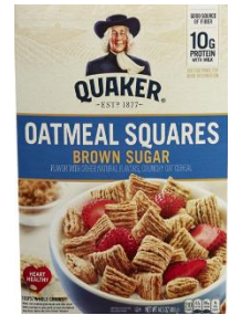
Quaker Squares Brown Sugar