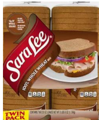
Sara Lee Whole Wheat