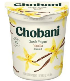
Chobani Greek & Original All Flavors

This is not a complete list of all credible items available. For questions about if a product is credible and/or whole grain-rich, please contact Providers Choice.