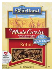
Heartland Whole Wheat Pasta