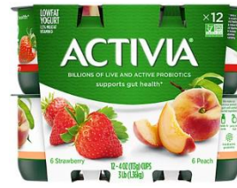
Activia All Flavors