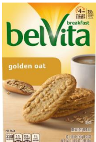
Belvita Biscuits All Flavors (not sandwiches)