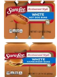
Sara Lee White Hamburger & Hot Dog Buns