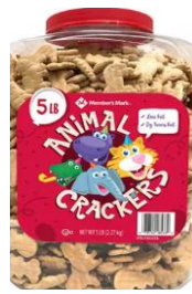
Member's Mark Animal Crackers