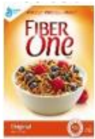
Fiber One Original