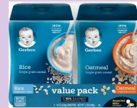
Gerber Iron-Fortified Infant Cereal Rice and Oatmeal