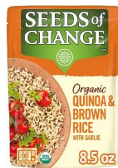
Seeds of Change Quinoa & Brown Rice